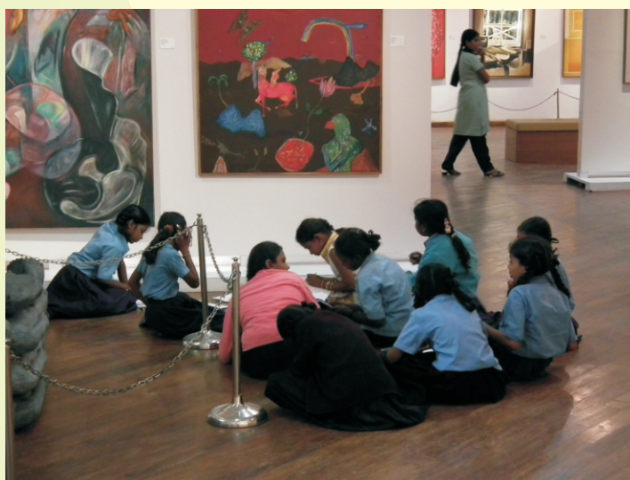
School children at NGMA, Bengaluru with the Director and Programme & Exhibition officer