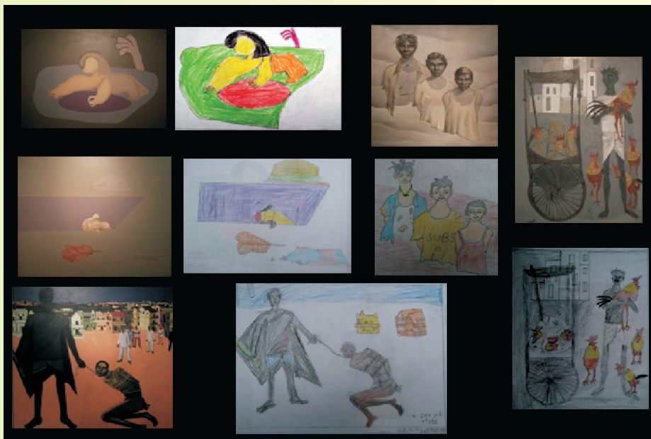
Original paintings and copies by school children

An extremely happy outcome of this venture is that Government schools have responded with great enthusiasm. Every Friday has been reserved for children from Government schools and a detailed calendar has been drawn up for every Friday from the first week of August 2010 till the last week of February 2011, indicating the name of the school and the number and grades of the children. Many of the children have shown promising talent and have drawn pictures which are remarkable in their likeness to the original works of art.