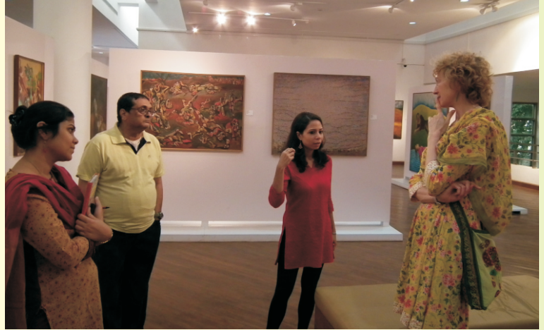
Assistant Curators with visitors during the gallery walk

The bi-weekly guided tours for discerning gallery viewers were started in August. The tours are conducted by the two assistant curators, and are held on Wednesday afternoons and Saturday mornings. They offer insights into the various nuances of Indian art. The Wednesday tour introduces the language of visual arts and covers form, harmony, color, balance and other key aspects of art. The tour on Saturday offers a chronological history of Indian art, starting with the Mughal miniatures, to the formation of the Bengal school and the nationalist uprising in the arts, till the present day. Though the initial response to these guided tours was muted, word soon got around, and a sizeable number of people now undertake the tours every week. The feedback on these tours has been extremely encouraging.