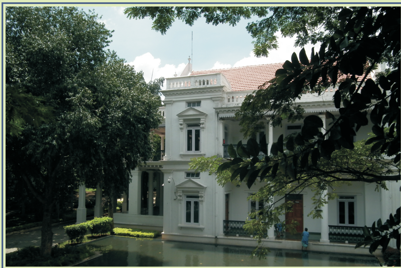
A view of the Gallery Building