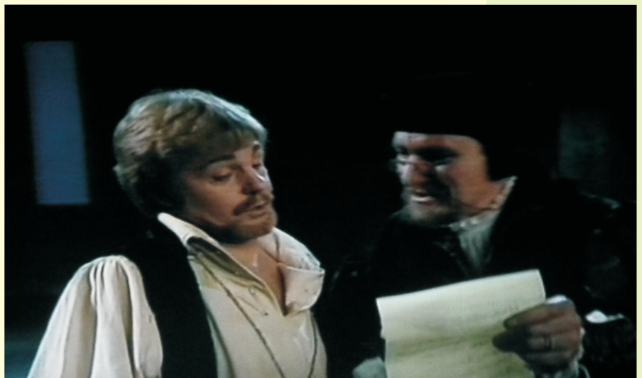
A scene from 'Hamlet'