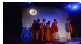
DAY-3 : CHHUTTI