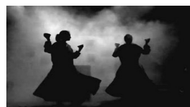
DAY-2 : ICCHAPOORTI