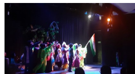
DAY-1 : TOTA – AZADI KI UDAAN