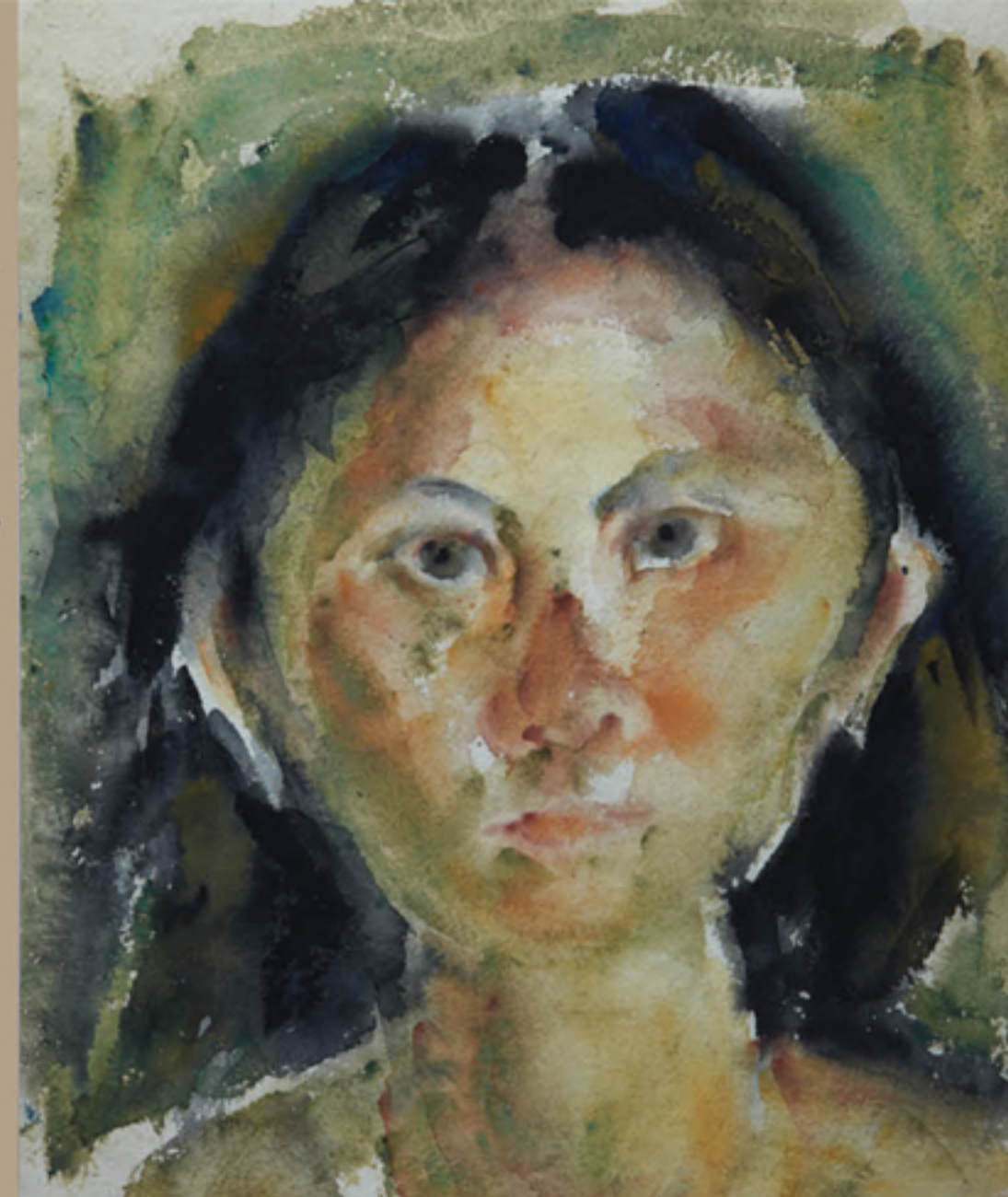
Image Credit: Binodini 1948 Water colour on paper 26 x 36 cm Acc. No. 2820 Collection: National Gallery of Modern Art, New Delhi

NATIONAL GALLERY OF MODERN ART Jaipur House, India Gate, New Delhi 110 003 Ph 91-011-2338 4640, 2338 2835 Ext 216, 225 Telefax 91-011-2338 4560 ngma.delhi@gmail.com www.ngmaindia.gov.in