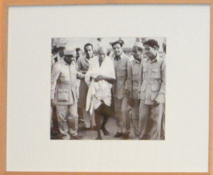
Members of the Defence Committee, 1945.