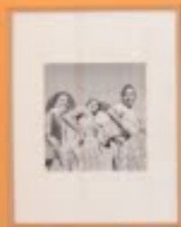
Small white caption card below the photograph.

Journeys with a Camera Excerpt from the introduction of 'Journeys with a Camera' by the author. The text discusses the author's experiences of traveling across the country and the role of the camera in capturing these moments. It mentions the author's travels in the 1930s and 1940s, and how the camera became a companion on these journeys. The text is in Hindi and is presented in a clean, sans-serif font on a white background.