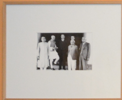
Members of the Defence Committee, 1945.

Roy's photographs capture the solidarity and determination of Congress leaders to secure the release of the prisoners and suspension of their trials. Such documentation further galvanized mass support and public fury; the resulting political fall-out hastened the end of the Raj.