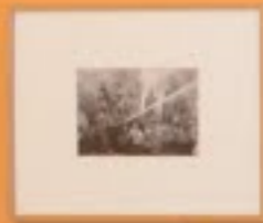
Small white caption card below the photograph.