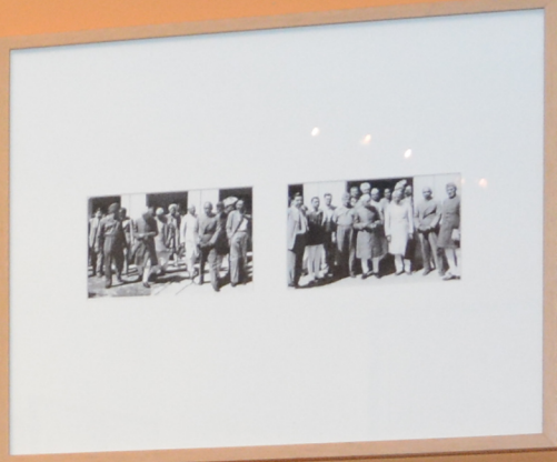
A group of people standing together, possibly a group of soldiers or officers.