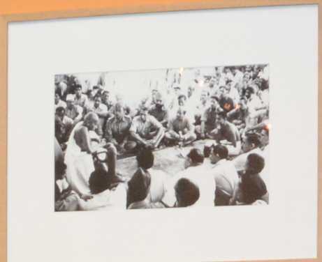
A large crowd of people, possibly a public meeting or protest.