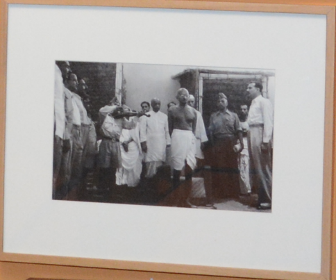
A group of people standing together, possibly a group of soldiers or officers.