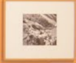
Small white caption card below the photograph.