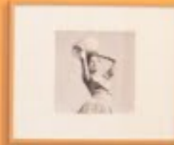
Small white caption card below the photograph.

कैमरे के साथ यात्रा Excerpt from the introduction of 'Journeys with a Camera' in Hindi. The text discusses the author's experiences of traveling across the country and the role of the camera in capturing these moments. It mentions the author's travels in the 1930s and 1940s, and how the camera became a companion on these journeys. The text is in Hindi and is presented in a clean, sans-serif font on a white background.