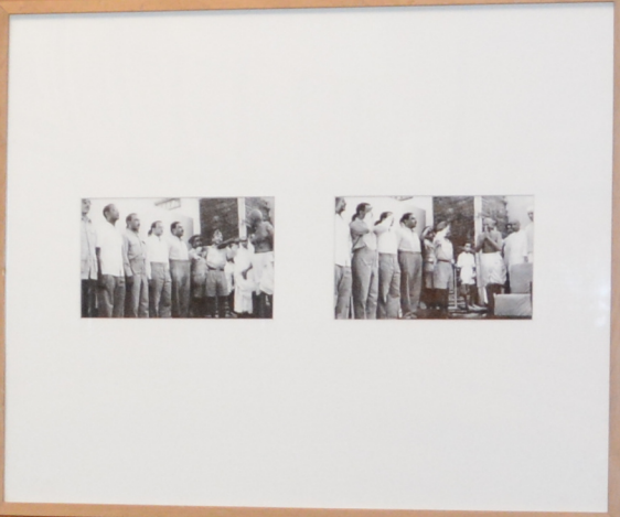
A group of people standing together, possibly a group of soldiers or officers.