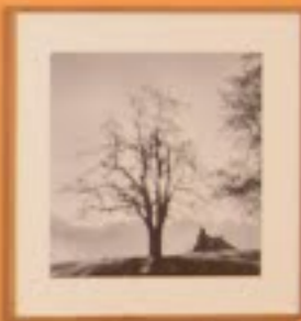
Small white caption card below the photograph.