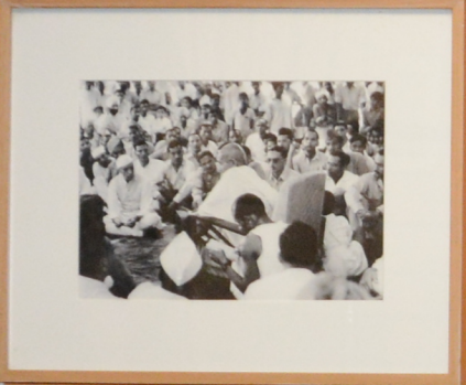
A large crowd of people, possibly a public meeting or protest.