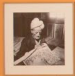
Small white caption card below the photograph.